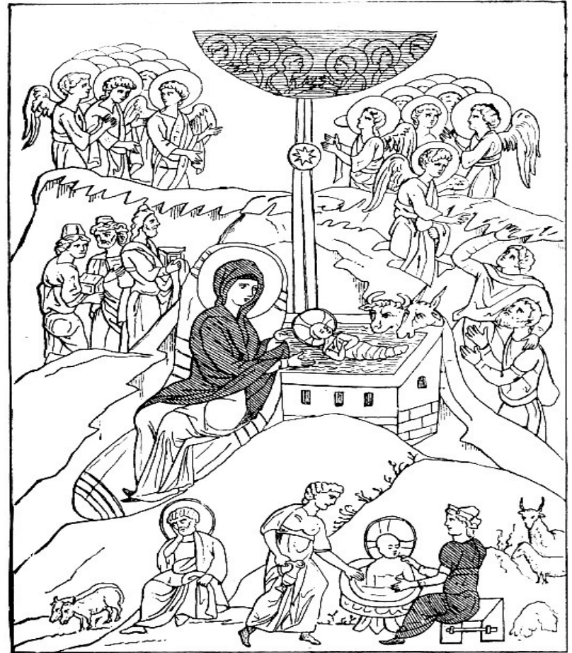
THE BIRTH OF CHRIST.

FROM A "BOOK OF THE EVANGELISTS." GREEK MANUSCRIPT OF THE TWELFTH CENTURY.